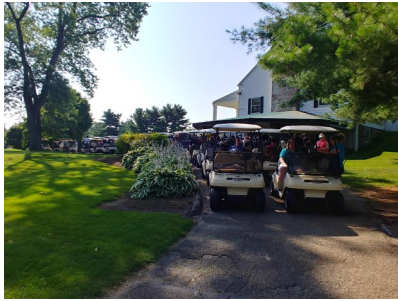
The carts are lined up and ready to go!