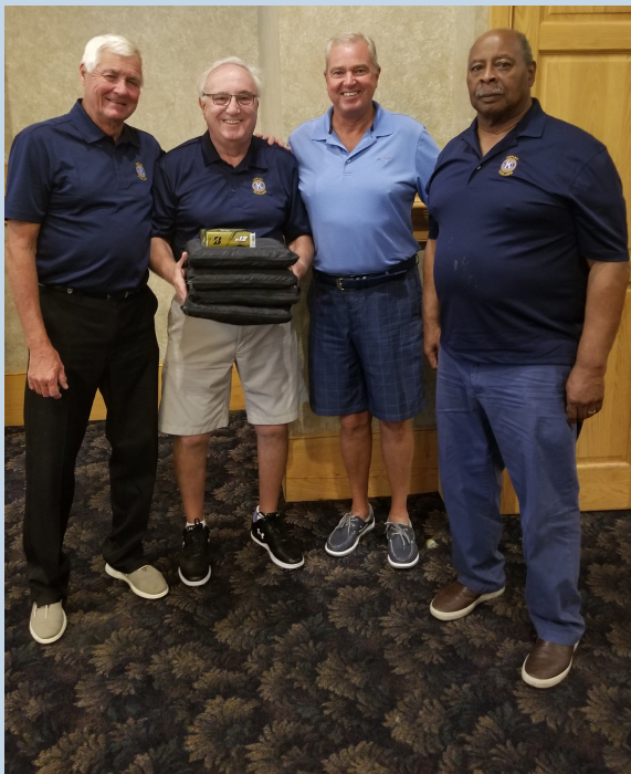
2021 ODKF Golf Outing Winning Team