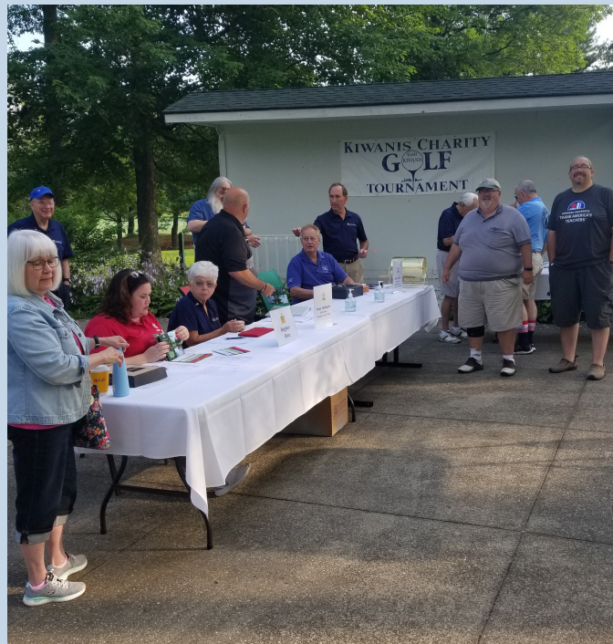
Volunteers and Staff Greeting the Golfers