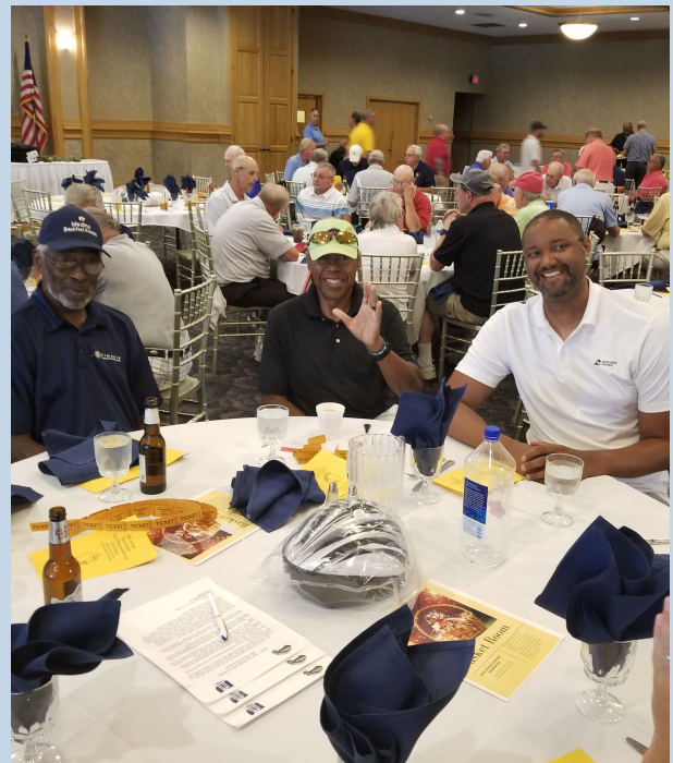
Enjoying the Luncheon!