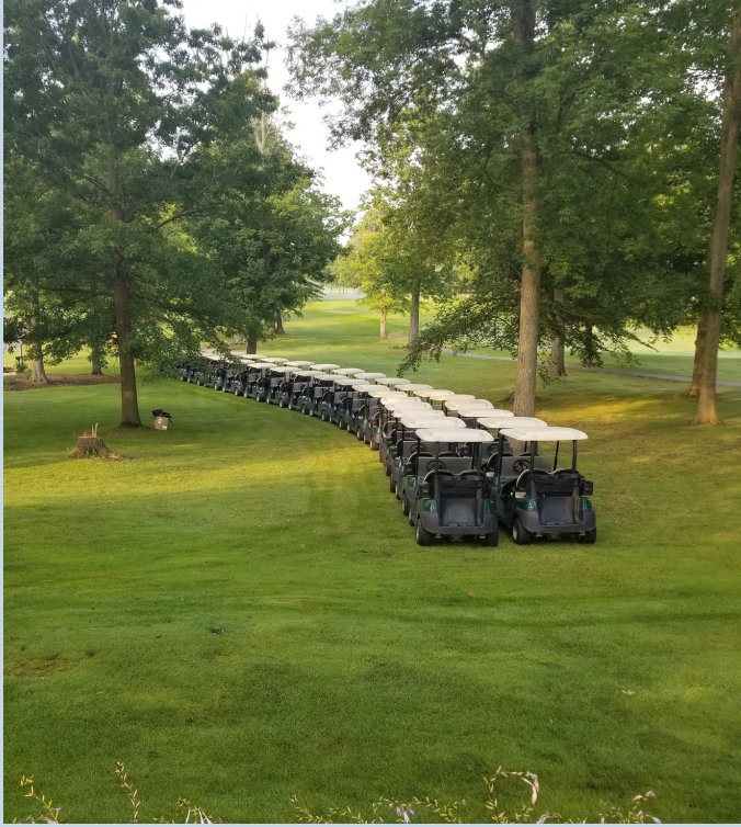
Carts waiting on the Golfers